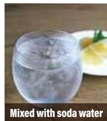
Mixed with soda water

When mixed with water you can drink it at the strength that is best for you. 'Maewari' refers to the process of diluting shochu with water and letting it sit and has a mellow taste.