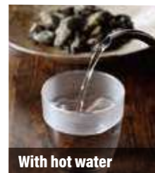
With hot water

You can also dilute it with carbonated water. Especially in the summer, it is easy to drink and is recommended. Adding citrus fruits such as the hebesu or the hyuganatsu can also give it a refreshing taste.