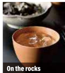
On the rocks

Miyazaki authentic shochu is not only an evening drink but can also be an aperitif and an accompaniment drink. You can enjoy it in a variety of ways depending on your preference.